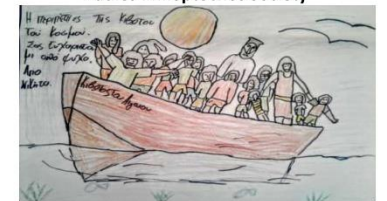
PROJECT: ΚΙΒΩΤΟΣ ΤΟΥ ΚΟΣΜΟΥ (ARK OF THE WORLD)

"Over 500 children of all ages come to the Ark". "Our door will always be open for them".